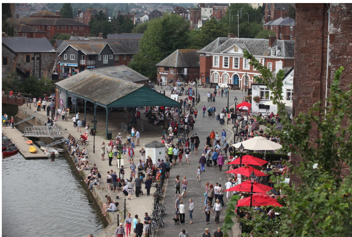
Exeter Quay - an increasingly popular destination, but with the potential for so much more, both within the city and along the canal.