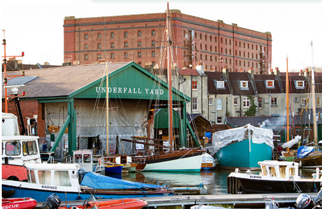
Underfall Yard in Bristol shows how a working heritage facility can contribute to an economic revival. Traditional skills are allied with an intriguing tourist destination.

The Exeter Heritage Harbour Route Map will lead to a sea-change in perceptions of, and connections with, the water for Exeter’s residents and visitors through the renewal of maritime life on the canal and basin. Not just a Heritage Harbour—a Heritage Harbour for today and tomorrow.